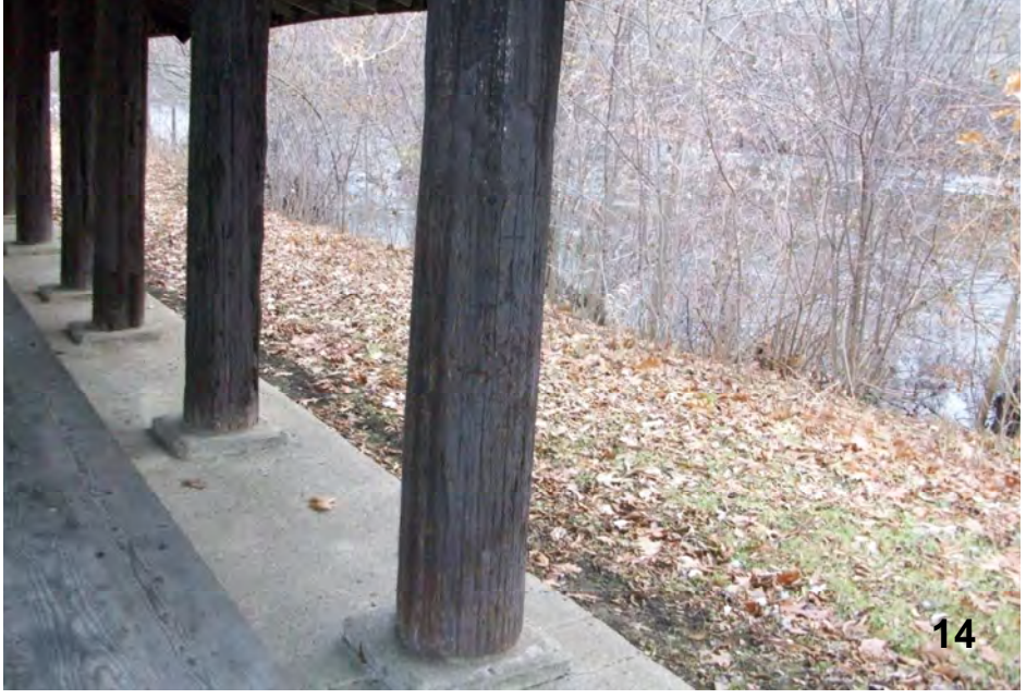
Vegetation shall be removed to improve the view of the river that is less than 15' away.