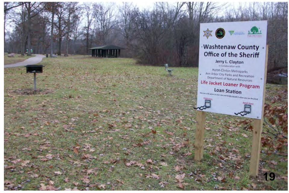
The sign for the Life Jacket Loaner Program will also be moved to an accessible location.

The project includes removal of soil and trees within the outlined area above to create a large continuous beach area.