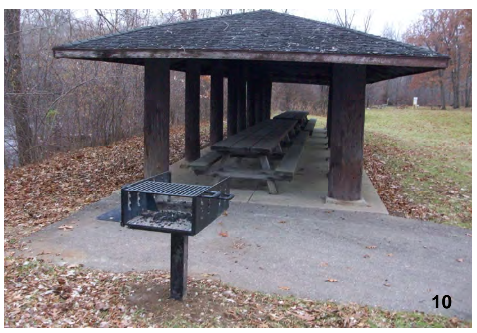
New concrete pavement is proposed under and extending out beyond the roofs edge on all four sides.