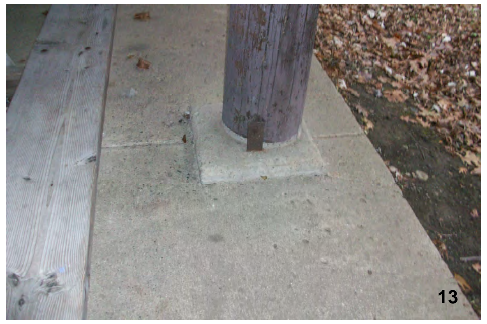
The concrete floor will be replaced and elevated to eliminate the tripping hazards around each of the posts.