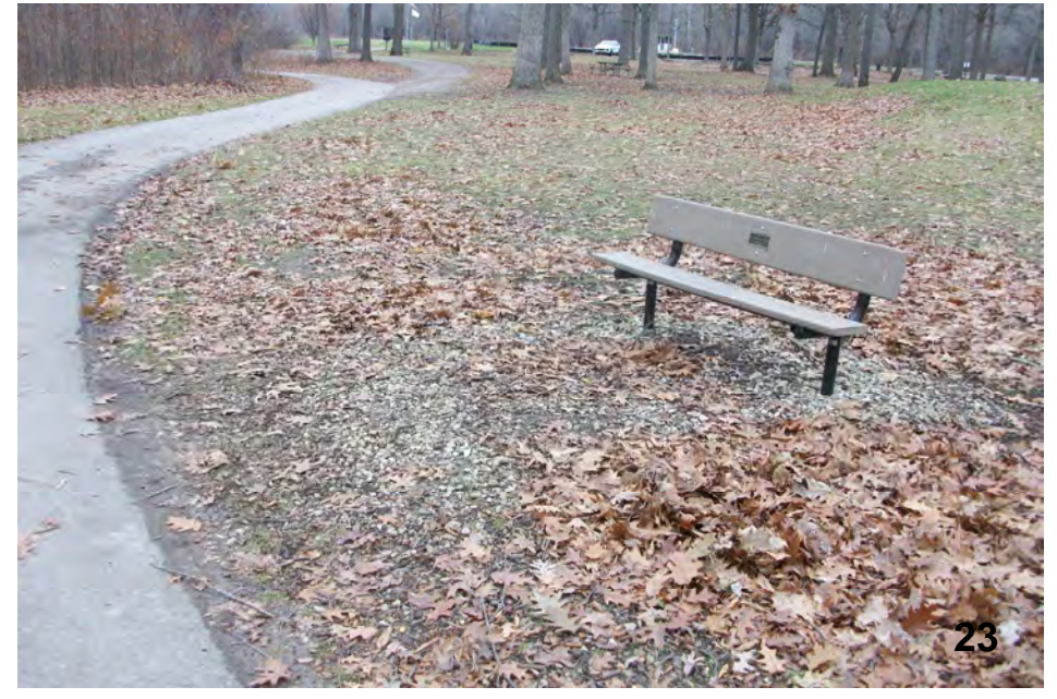
Benches to be located a minimum of 3' away from the Iron Belle Trail. Wheelchair companion seating to be provided on one side of each bench.