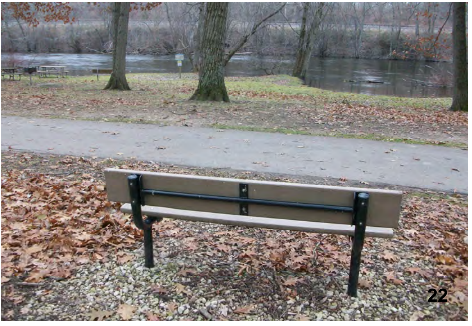
Three of the benches will be replaced and located in accessible locations. Benches to be surface mounted to concrete.