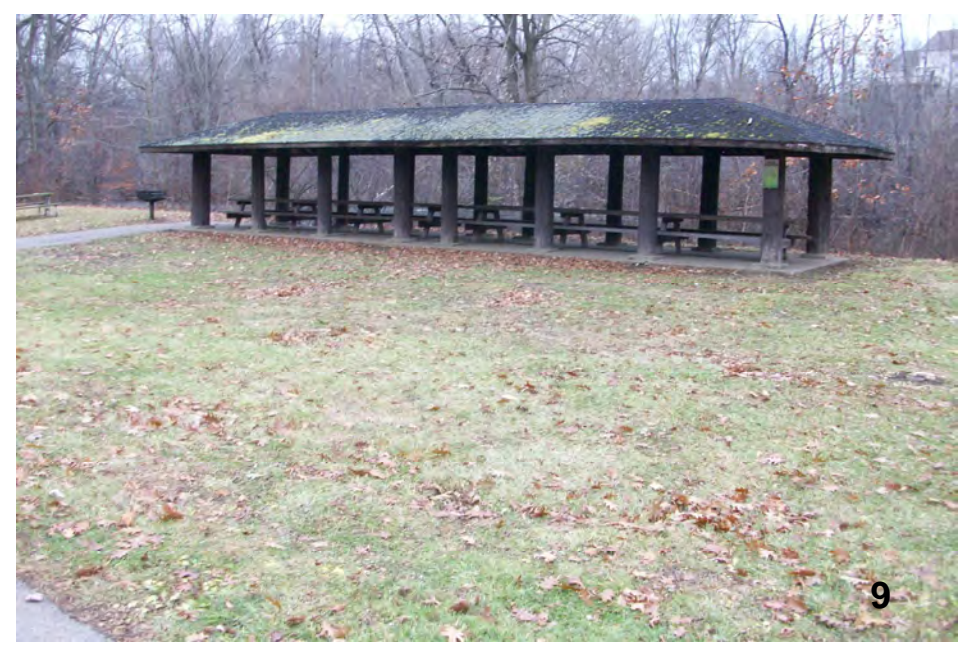
New universal accessible concrete access routes to be provided on both sides of the shelter. The existing walk exceeds 5%.