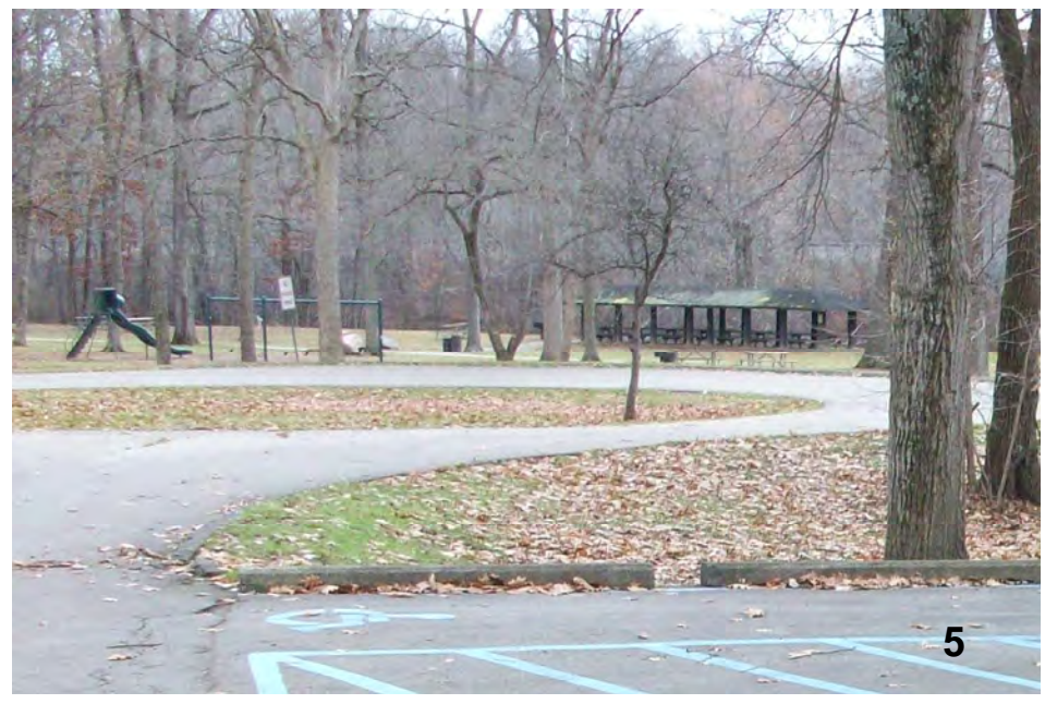
Catch basin in middle of circle to be removed, pipe abandoned in place. Circular turf area to be used as small retention area.