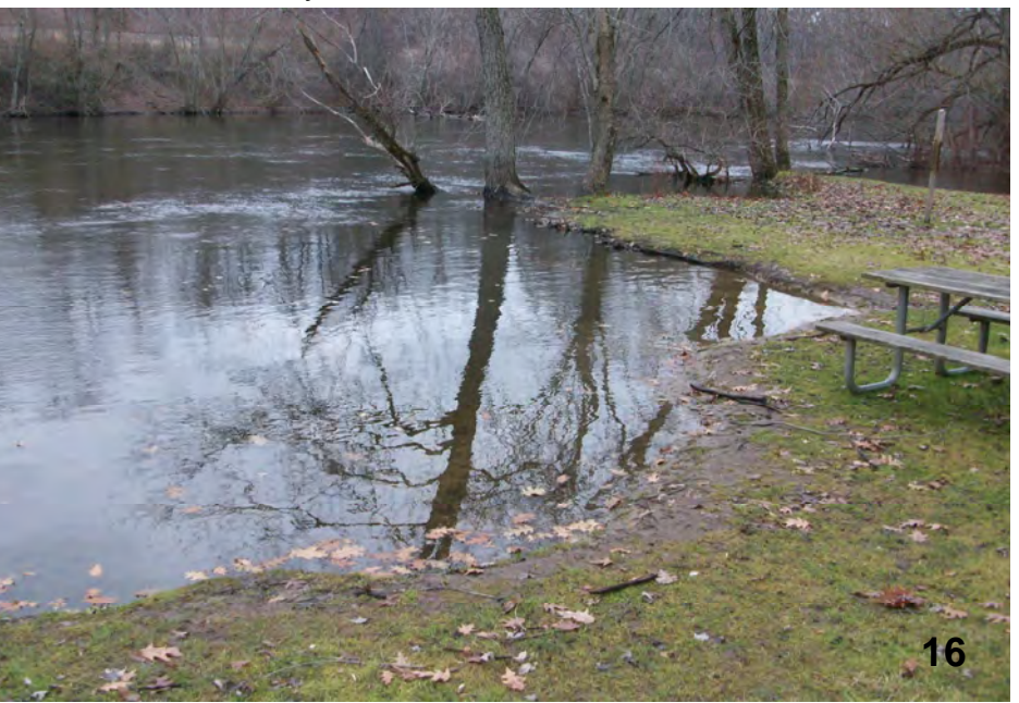
Location for the proposed floating accessible launch. The existing trees shall be removed to create a larger beach area. Sand will be installed to create a beach area; width will vary.