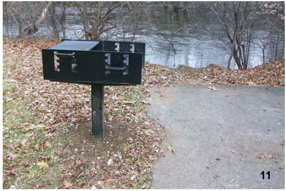
A large universal accessible swivel grill is proposed on the new pavement that will extend out from the picnic shelter.