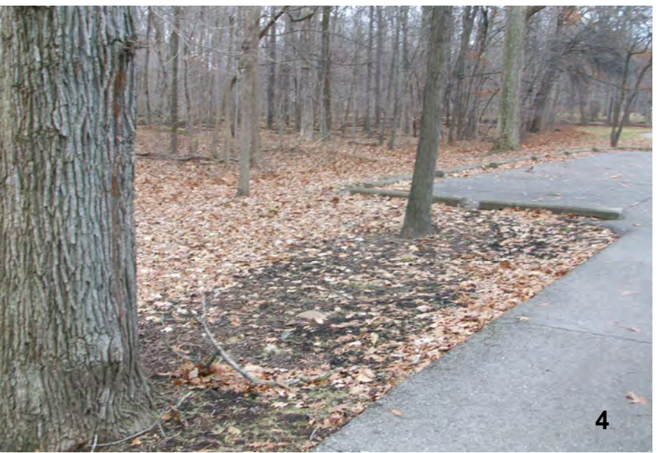
These spaces shall be lengthened and angled to create 4 new trailer parking spaces. Two spaces will be striped and signed for van accessibility. Tree removals required.