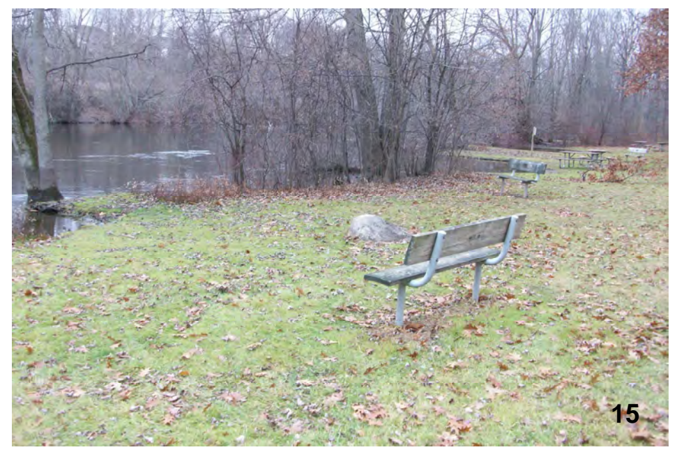
The two closest donor benches to remain.