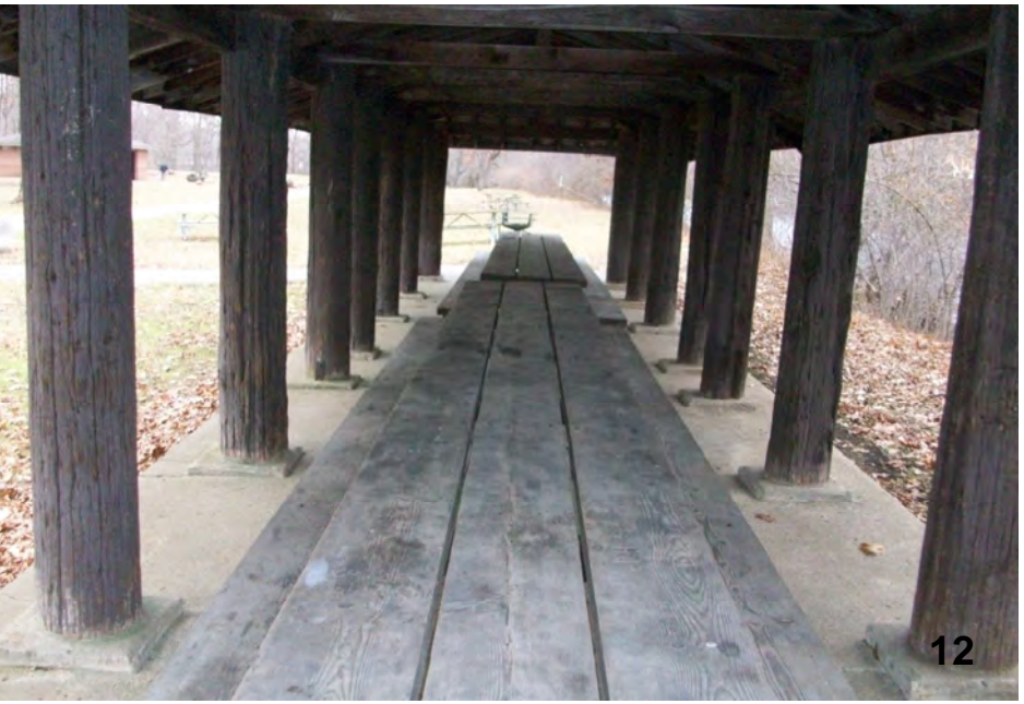
New universal accessible picnic tables will replace these long wood tables.