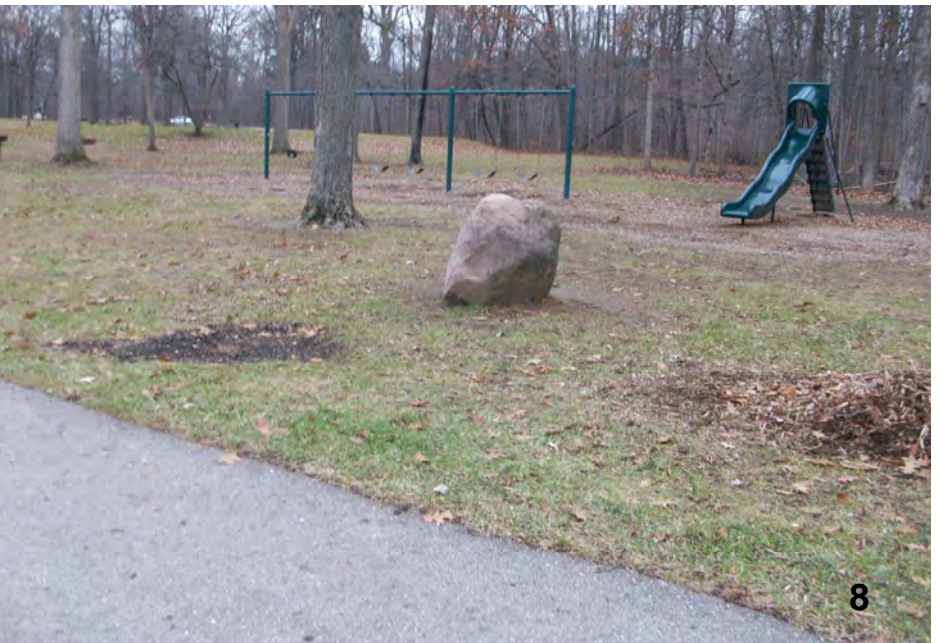
A 6' wide universal accessible concrete walk is proposed into the corner of the play area (on left). A new concrete ramp shall improve access onto the play area surfacing.