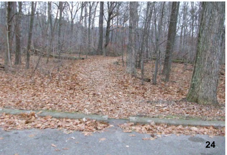
The alignment of the rustic hiking trail will likely shift to align with the proposed accessible route near the parking lot. The alignment will be completed separately and is not a scope item.