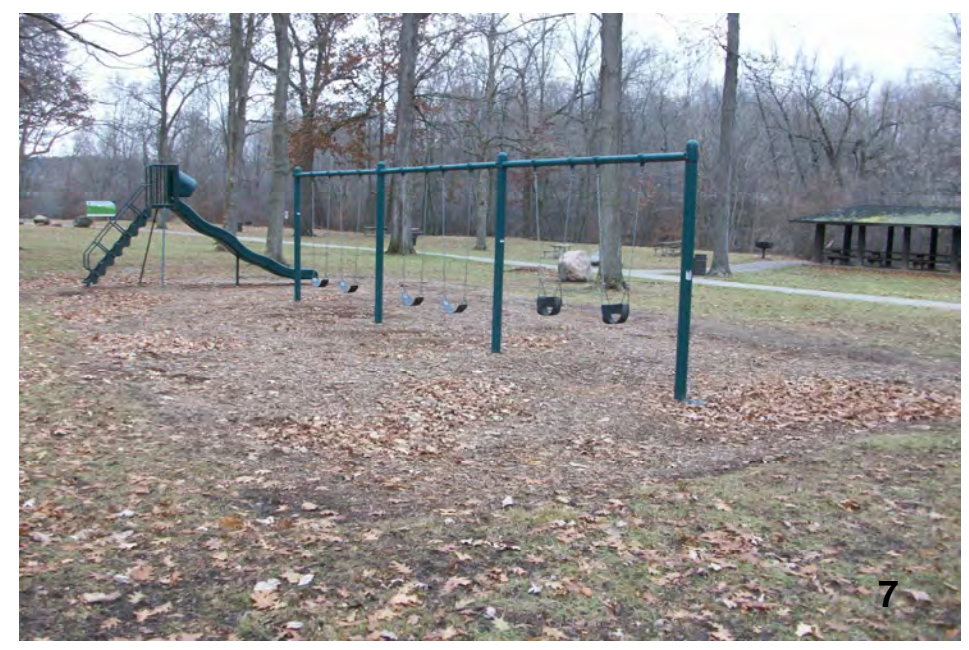
Two belt swings in the middle to be removed. Bucket swings to be moved to the middle. Two new molded bucket harness swings to be added for kids with limited upper-body mobility.