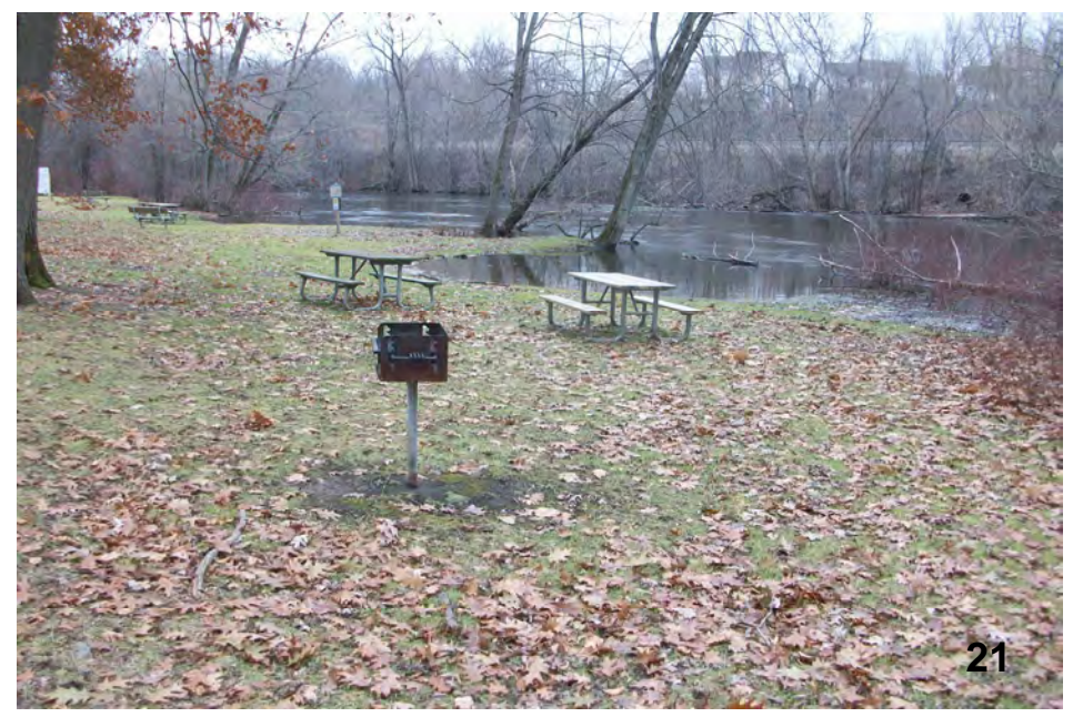
Accessible picnic units with concrete walks / pads, universal accessible tables and grills are proposed in three locations.