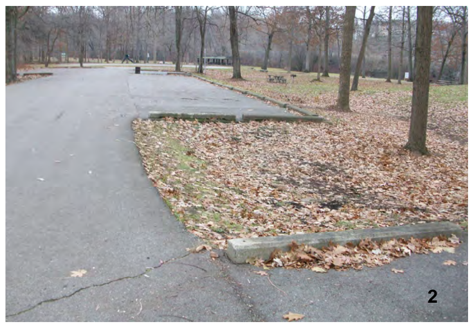
Existing parking lot to be restriped. The existing swings, shelter, and the Huron River can be seen in the distance.

Small turf area between the two parking areas to be filled in with new asphalt. The accessible spaces will be moved slightly so a new universal walk can be constructed to the river and shelter, minimizing tree removals.