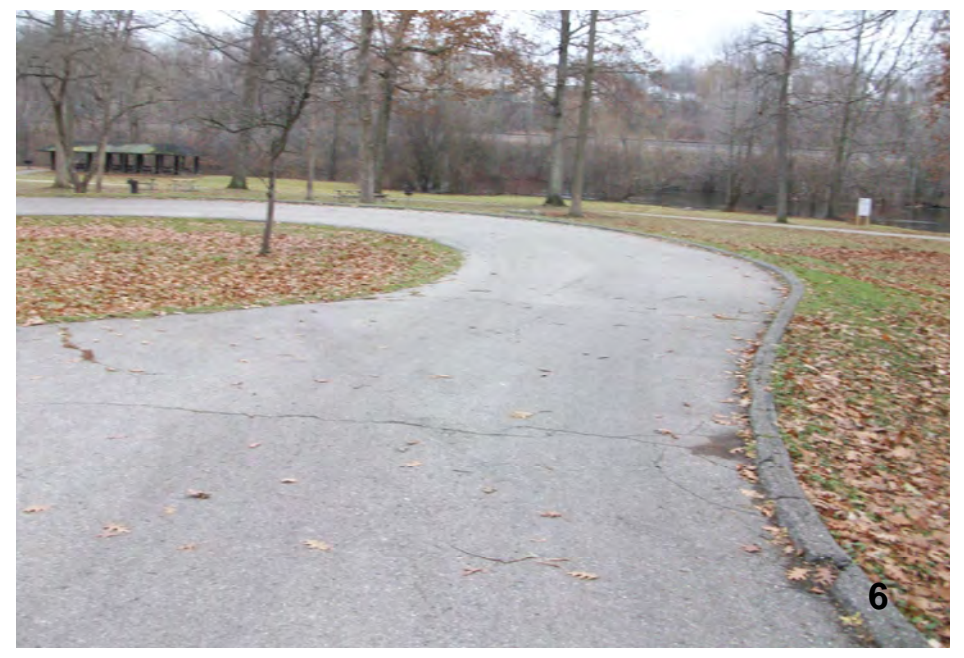
A new aggregate loading and unloading area is proposed along the edge of the turn-around. Some curbing to be removed.