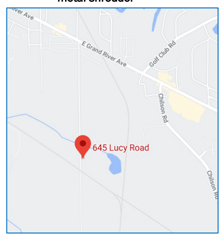
Figure 1. Location of proposed scrap metal shredder

containing materials. The scrap metal shredder and associated equipment will break down and separate waste material from the product (recycled metals). Material not able to be recycled would be sent to a landfill. The proposed equipment has air emissions which require an air permit.